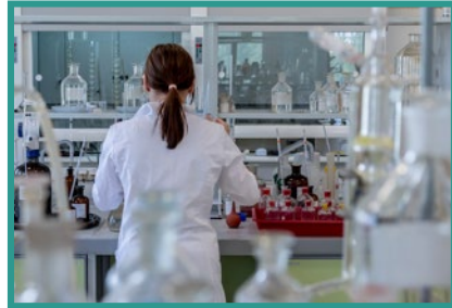
Research and Healthcare institutions